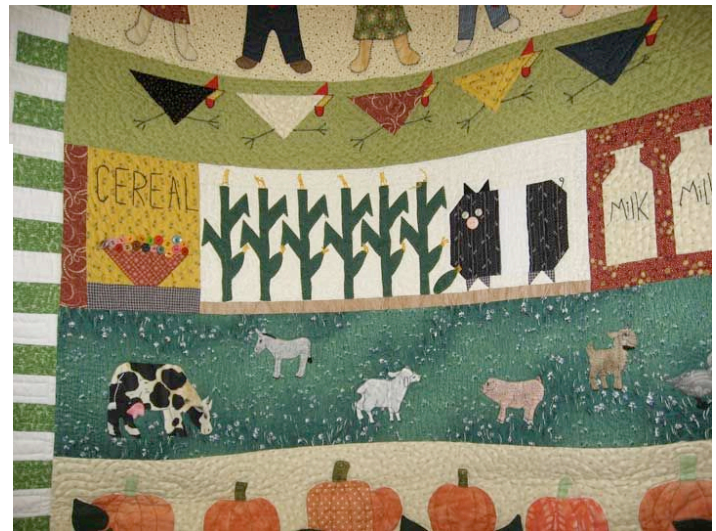
Cindy Brock displayed numerous quilts. Here are some details.